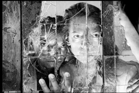
ACHERON: THE RIVER OF TRAGEDY July 27-30