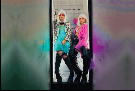
TRASH BODY MONKEY HOUSE July 6-10