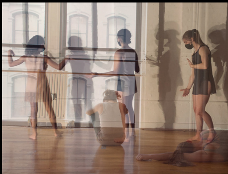
BODY THROUGH WHICH THE DREAM FLOWS August 3 - 6