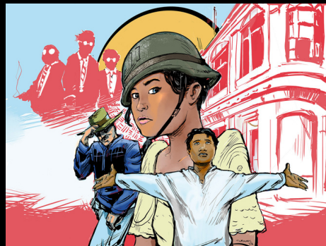
THE STRANGE CASE OF CITIZEN DE LA CRUZ August 10 - 13