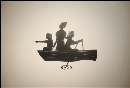
ISLA July 20 - 23