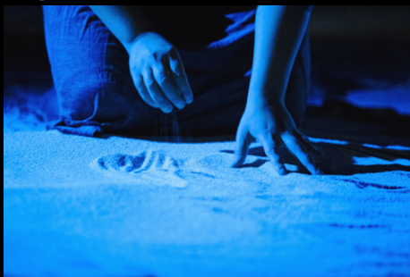
SALT August 17 - 20